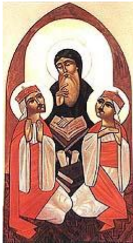
Venerable Macarius the Great