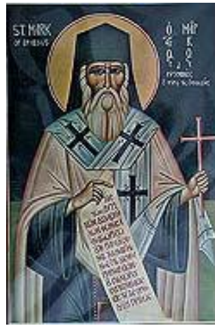
St. Mark of Ephesus